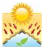
Strength against UV radiations