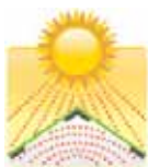
High light transmission